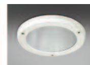
CIR/65P IP65 Sealed Bezel