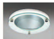
CIR/HR Drop Halo Ring