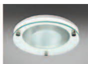
CIR/CGS Drop Clear Glass Spot