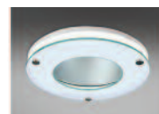
CIR/HO Drop Halo Ring Opal