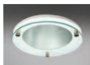
CIR/CG Drop Clear Glass

Optional Accessories: Mounting Bezel (/MB) must also be order to use these accessories