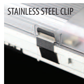
STAINLESS STEEL CLIP